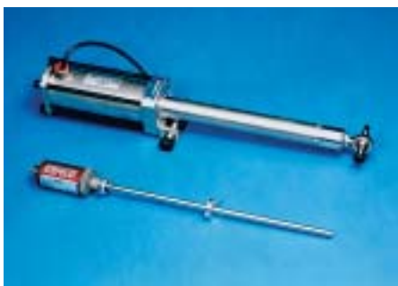
Series 951 LDT, 952 BlueOx™ LDT (not pictured) and 950 MD Mill-Duty Housings