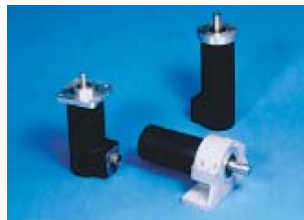
Series 1986 Standard Resolver Packages Gemco is a trademark of Ametek.